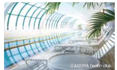
②AGORA health club

*Rates include service charges (10%) and taxes. *Lodging tax (¥100~¥300) is a charged separately. *Breakfast is available for an additional charge of ¥2,000 per person. Cancellation fees apply from the day before check-in. (No show: 100%, Same day: 80%, Day before check-in: 20%) *Extra beds are available for the additional charge of ¥4,000 per bed (tax and service charges included). For Executive rooms, the additional charge is ¥8,000. *All Fees are subject to change per availability conditions. [Date Updated: July/2019]